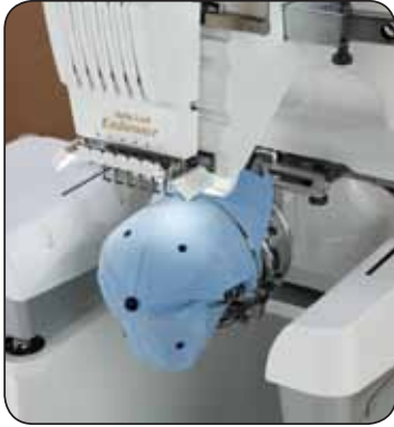
Advanced Cap Frame Set

No matter where your creativity takes you, Baby Lock has an optional accessory that gets you there.