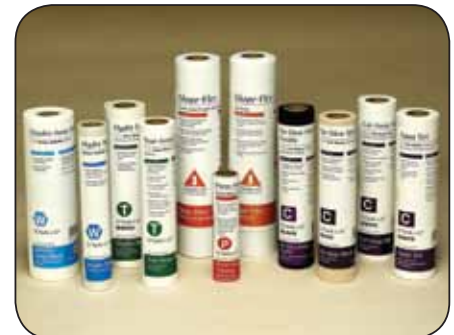
Baby Lock Stabilizer