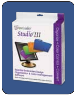
Studio III Cataloging Software